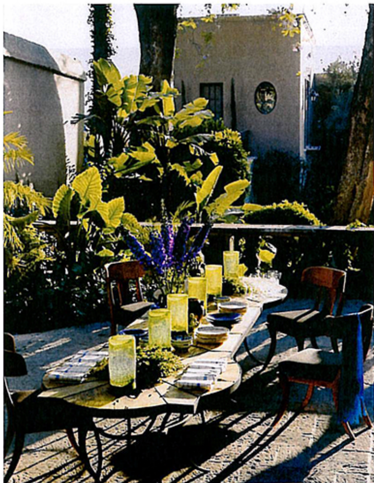
The designers built the guest casita to host their frequent visitors. Left: The tables on the dining terrace are by Fisher Weisman for their new furniture and accessories line, also called Casa Acanto; the Michael Taylor Designs chairs are covered in a Sunbrella fabric. Below: Adjoining the main house's dining room is the sala abierta, a favorite spot for entertaining.